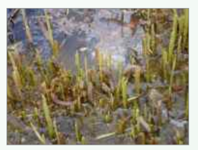
Defoliation (Swarming caterpillar)