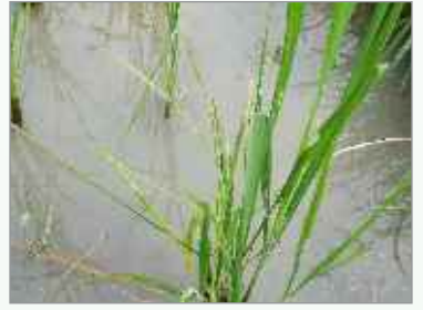
Silver shoot (Gall midge)