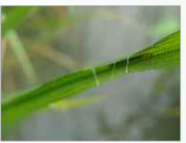
White ear head (Stem borer)