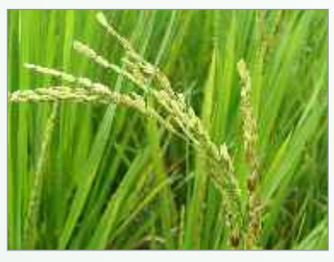
Grain discoloration (Gundhi bug)

Swarming caterpillar : Larvae feed gregariously and march from field to field. Newly hatched larvae cause the plants to look sick with withered tips and cut leaves. They appear suddenly in masses and move from one field to another field in large numbers like an army and almost completely defoliate the rice crop, when it attacks direct seeded fields. In severe infestation the field looks like cattle grazed appearance.